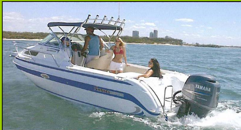
HAINES HUNTER 625 HORIZON & F150.

Model: F150 AETX Engine Type: 2670cc IN LINE 4 EFI, DOHC, 4 Valve. Rating: 150Hp @ 5000 RPM Weight (inc prop): 220 Kgs Gear Ratio: 2:1 (28:14) Hole Number: 3 Prop Size: 15"1/4 x 15" Prop Type: Black "M" Prop Part #: 6G5-45970-02-98