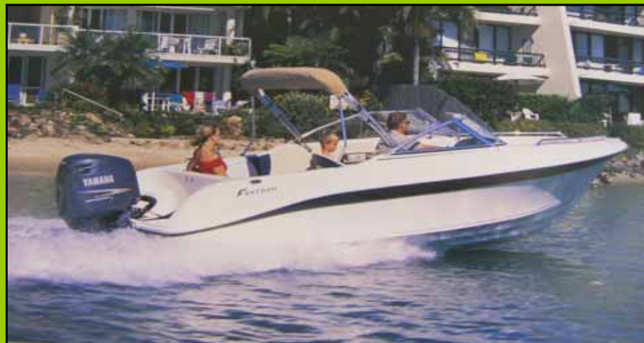
Freedom Mirage 6.0

Test Conditions People: 3 Air Temp: 23 Wind Speed: 3 Knots Fuel (Litres): 120 of 170 Water Temp: 19 Deg C Wind Direction: Easterly Conditions: Fine/Clear